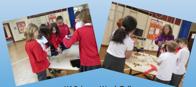
Y4 Science Week Talks

Please ensure your child has their PE kit in school. We recommend they bring it on a Monday and take home on a Friday.